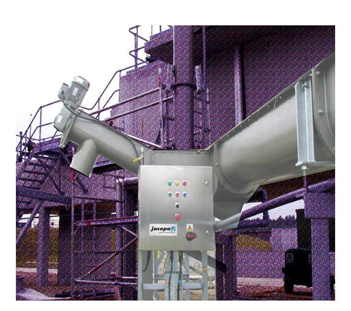
Jacopa Stone Trap

The trapped debris is elevated from the stone trap by a motorised inclined screw conveyor. The collected debris is then discharged to a container for storage and removal