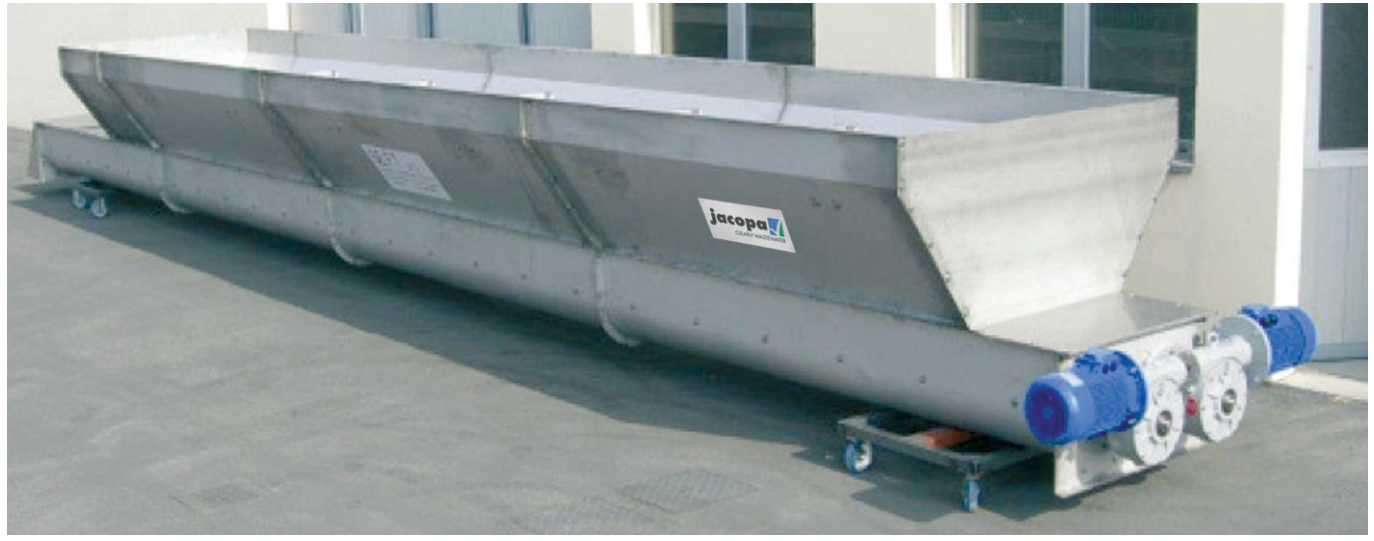
Contact Jacopa for further information on our DSC and DAC range of Double Screw Conveyors.

Copyright © 2017 Jacopa. All rights reserved.