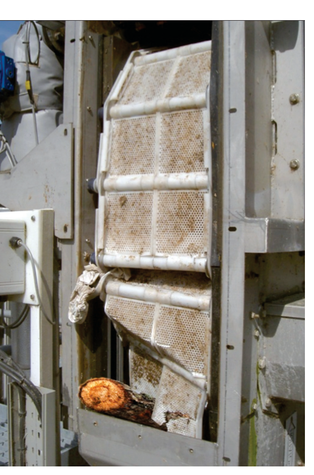
Damaged inlet screen

Bosker rakes can be customised, and are easy to retrofit into existing works without expensive modifications. They have many advantages over conventional trashrakes, which may need extensive civil works and have limited ability to remove oversize, awkward or fibrous debris.